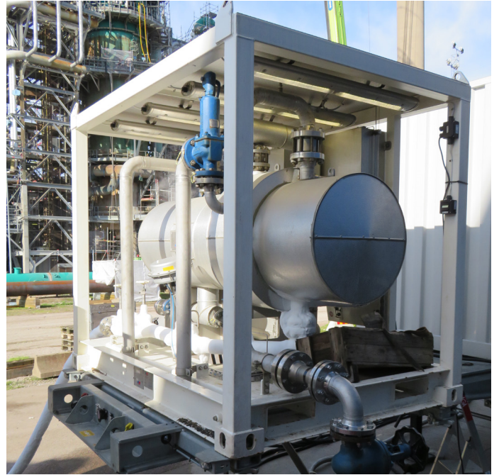
Linde's high flow steam vaporizer delivers liquified nitrogen in large amounts and high temperatures, adjusted to meet our customers' specific demands.