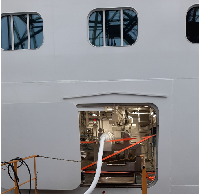
Drying and cooling tanks with liquified nitrogen at a LNG cruising ship, to prepare for the tanking process with natural gas.