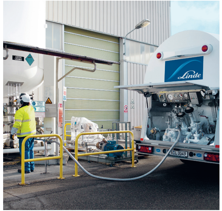
Safe and efficient unloading of liquified nitrogen from a truck to a tank.