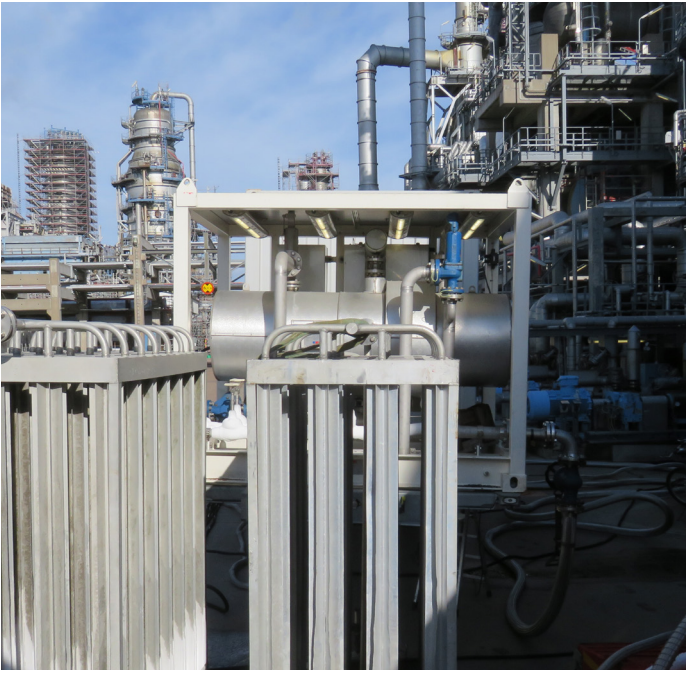
Tailor-made solutions and close monitoring.